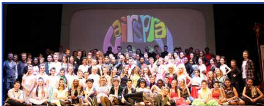
Hairspray Cast & Crew